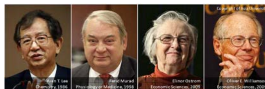
Nobel Laureate Forum (I)

*Continuing efforts paid to promotion of internationalization —Asia University continuously promotes its efforts in internationalization, having 71 sister universities all over the world in 2012. Within about 5 years the number of foreign students grows from about two dozens up to 250. Intensive academic exchanges with the sister universities are also being conducted all the time.