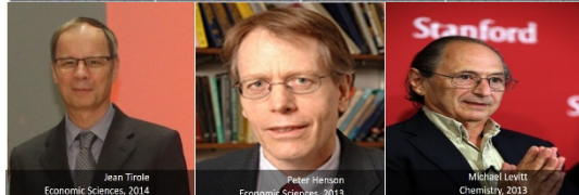
Nobel Laureate Forum (II)